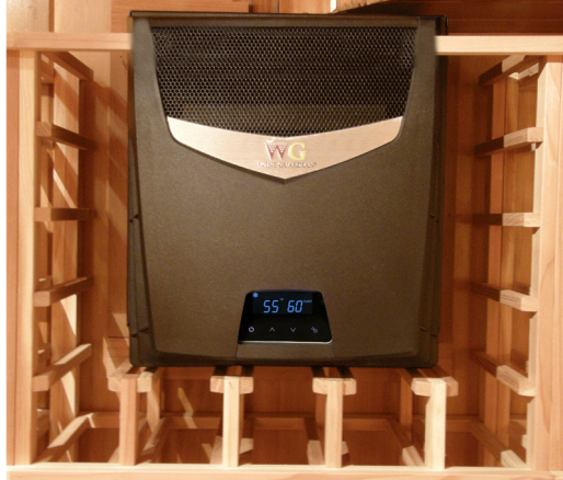
Front View in Racking