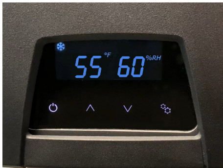
Front Digital Display