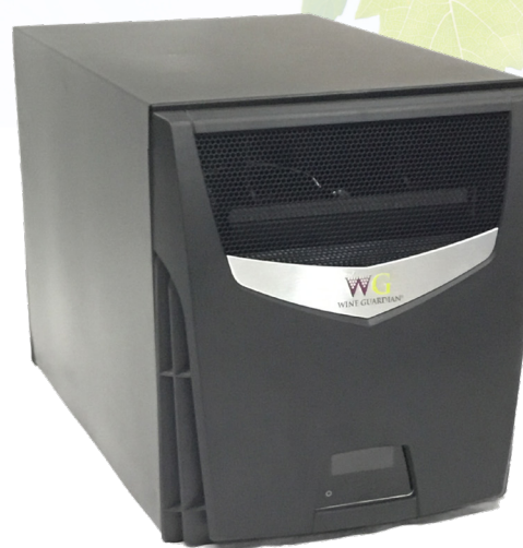
TTW unit out of racking