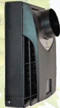
Back View With Optional Duct Adapter